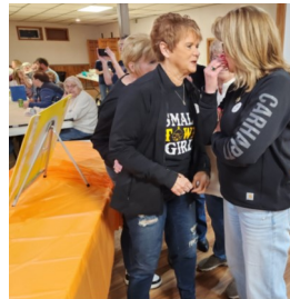
Above: The Merrill team convenes.