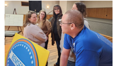
Above: The Remsen team convenes.