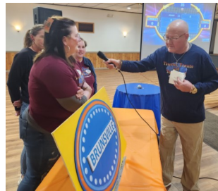
Above: The Brunsville team in the hot seat.