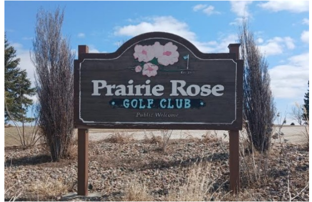
Above: The Prairie Rose Golf Club sign awaits golf players for the 2025 season.

The second scramble of the season is the Cancer Tournament 4-person on Sunday, June 22. The ladies cancer drive pink night is scheduled for Wednesday, July 9.