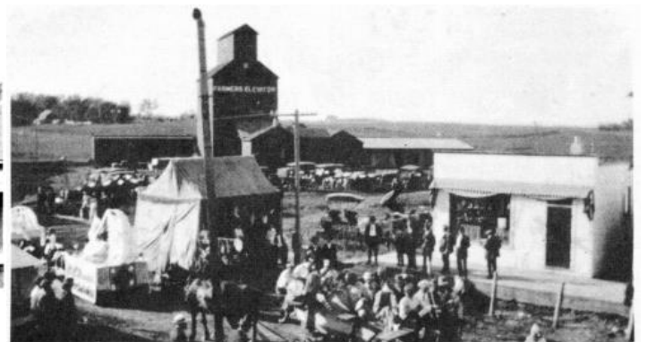
Celebration about 1913 showing part of parade and a stand