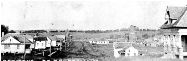
Above: View looking west from in front of where St. Peter Lutheran Church now stands.