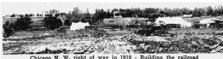
Chicago N. W. right of way in 1910 - Building the railroad

See more historical photos on the back page and at brunsvilleiowa.com .